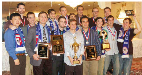
The Byki celebrate their 2006 awards.

The year 2006 gave the Byki many reasons to celebrate. The club's B Team finished in first place in the Blue Section in the 2nd Division, which means that the B Team will join their A Team brethren in the 1st Division for 2007. What's more, the sides will both play in the Blue Section and that means that there will be two A versus B derby matches next season.