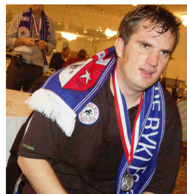
It's been a rough night for The Gaffer.